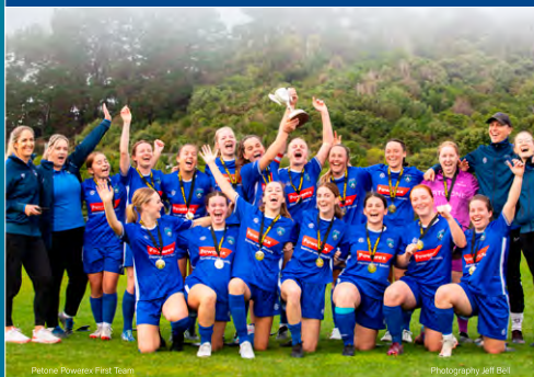
Petone Powerex First Team